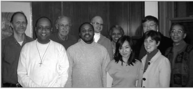
Presbyterian Welcome's Board of Directors