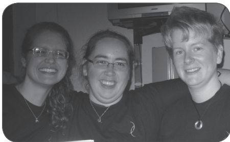
Students at Pub Night