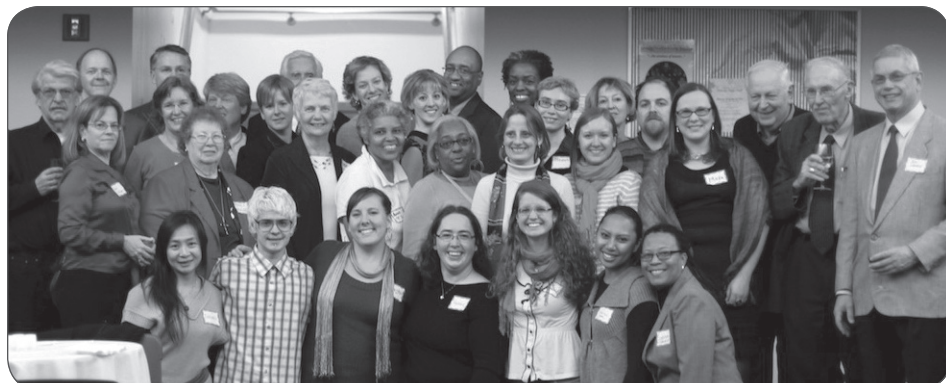
Union Theological Seminary alumni, students and staff at the Faithful Servant Event